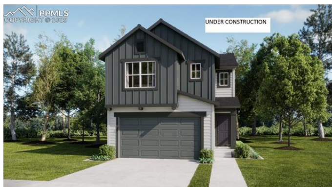
The Celestial Collection in Colorado Springs, CO FIR 3 bd, 2 ba, 1 half ba, 1,752 ft 2 FIR at The Celestial Collection in Colorado Springs, CO